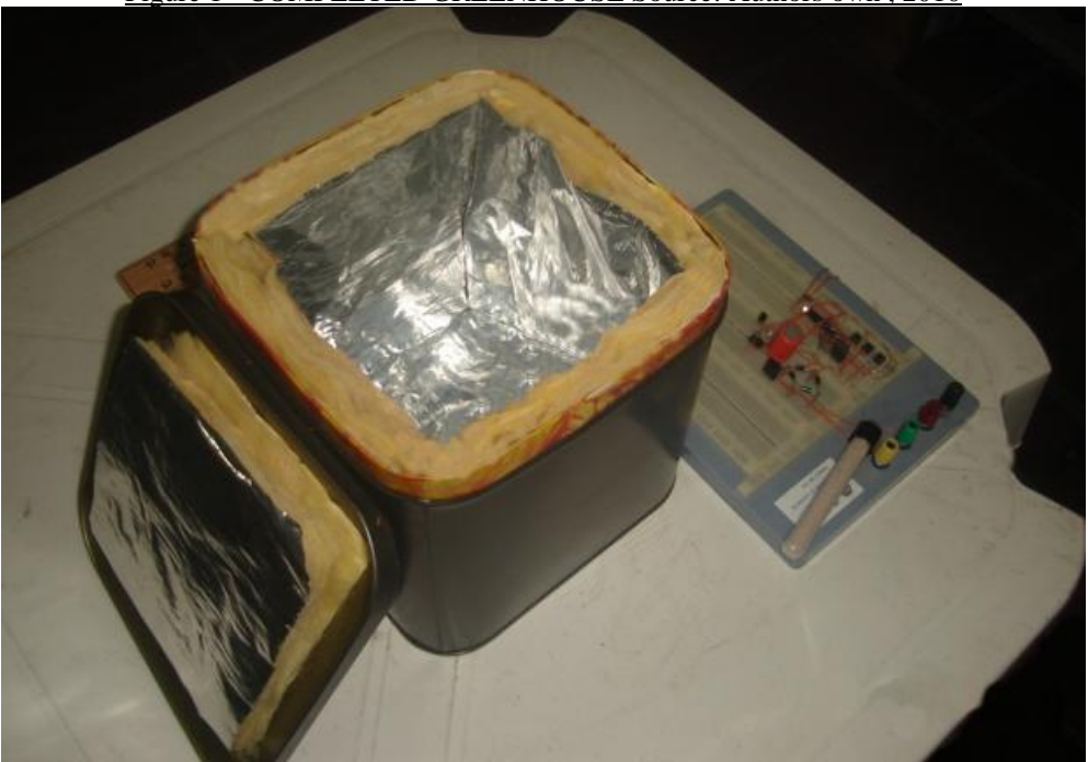
Figure 1 - COMPLETED GREENHOUSE

The system was put into operation in a mini greenhouse made internally with glass wool and coated externally with galvanized steel. After being connected to the system, it was done measurements and achieved satisfactory results being very close to the existing unit SANEPAR in Ponta Grossa-PR, Brazil, fulfilling the expectations of maintaining 35°C for 48 hours to perform the analysis of the water.