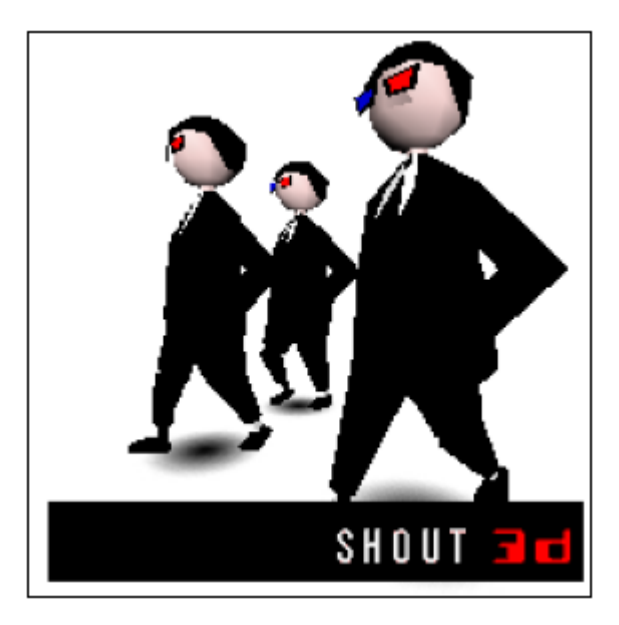
Figure 1: Render using Shout3D (free version), with the horizontal line of identification in detail.

There are two versions of Shout3D: one of versions is commercial and the other is not. However, one disadvantage of the free version is a horizontal line that the tool exhibits during all the execution time (Figure 1).