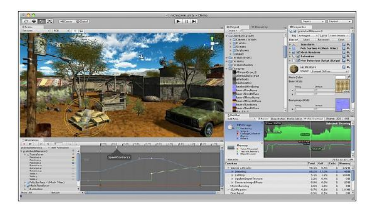
Figure 4: Scene editor of Unity 3D.

Among the disadvantages of Unity 3D we found that the free version has limitations on special effects such as lighting and post-processing (filters applied after the scene has been rendered). Another problem is that the free version also displays the logo of Unity 3D in projects. Finally, a plugin is supposed to be installed on client machines.