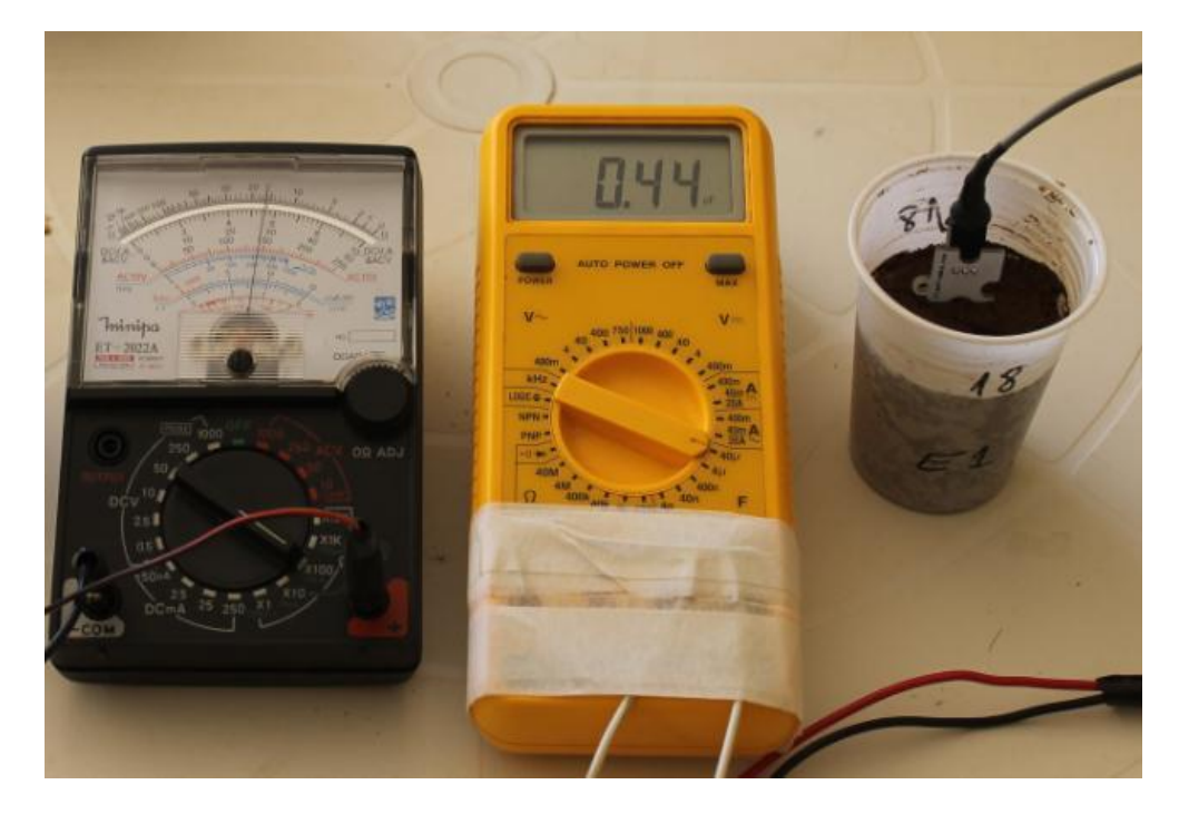
Figure 2 - Resistance Measurement and Electrical Capacitance.

The instruments of measurement to measure the resistance and electrical capacitance of the soil samples used were: an analog multimeter of Minipa brand, model ET-2022, selected to operate as ohmmeter, and to measure the electrical capacitance of the soil samples a digital multimeter was used, CIE brand, model 5175XL, selected to operate as a capacitance of Figure 2.