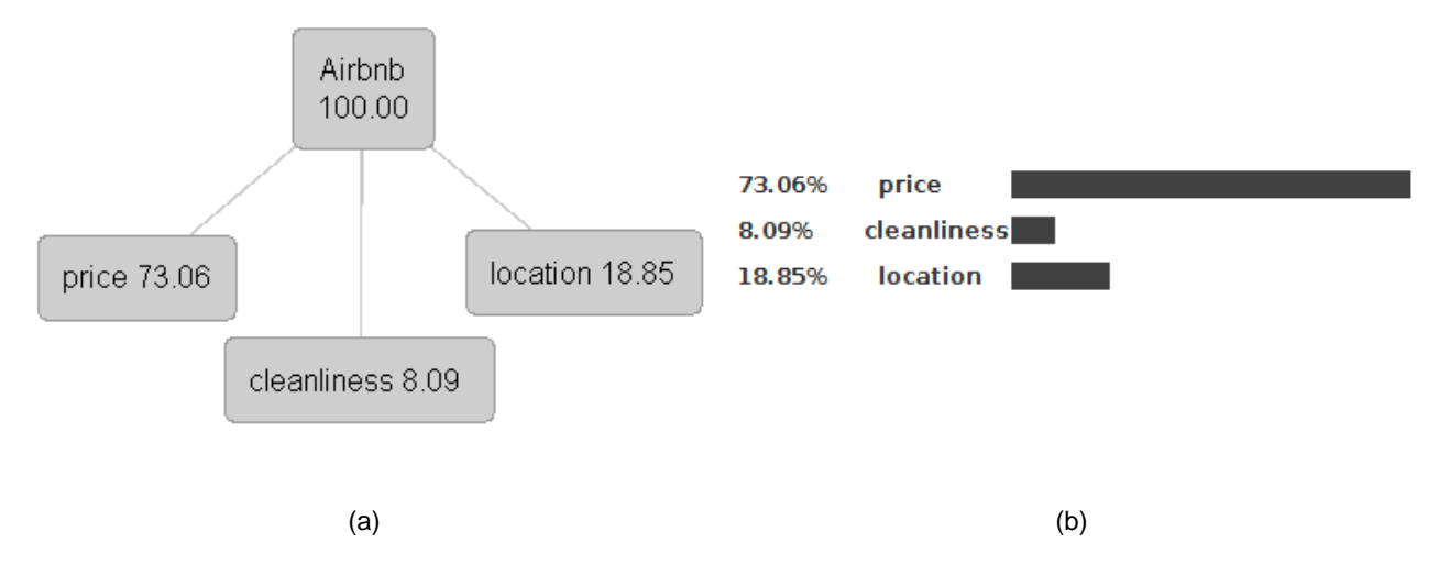
Figure 3 – Concluder AHP results, (a) percentage and (b) chart representation

Results of the Python program (Figure 2) were compared with Concluder program results (Figure 3) to check consistency and results.